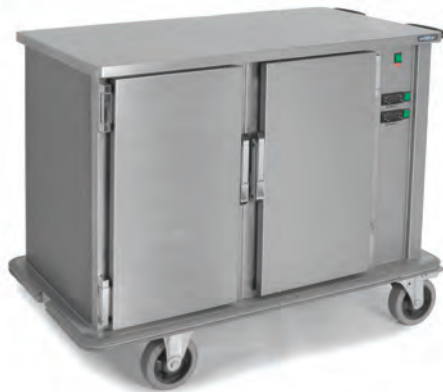
BF2 Bulk Food Trolley

The BF2B, BF2BR, BF3B and BF3BR also feature Bains Marie with covers to the top of the unit along with the combinations of ambient, heated or refrigerated compartments below.