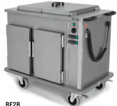
BF2B Bulk Food Trolley with Bains Marie

Conversion kit to transform compartment to accommodate plated meals (PM).