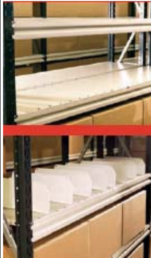
Optional Metal Shelf Dividers P.O.A