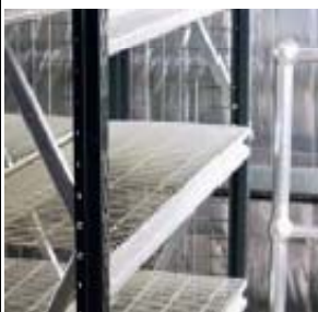
Optional mesh shelves

Please email to spacepac@spacepac.com.au for current pricing