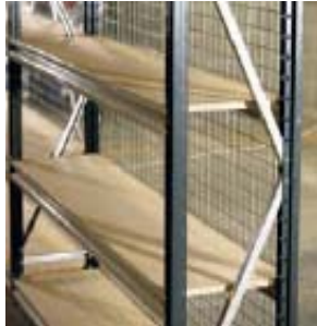
MDF Shelves illustrated Optional back mesh POA