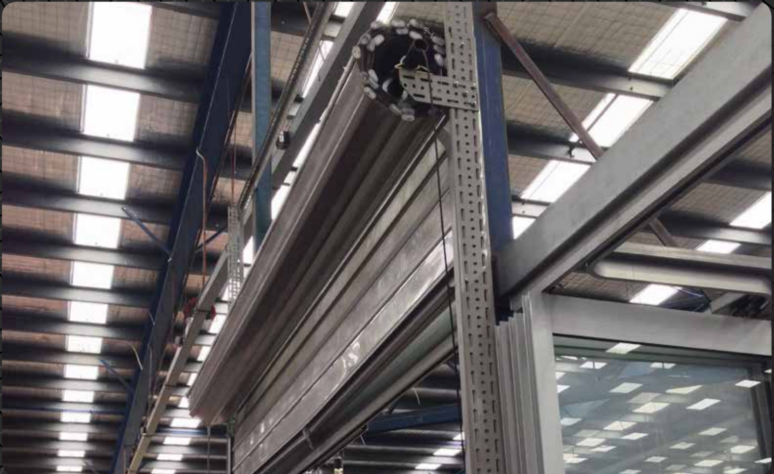
Roller Shutter Doors