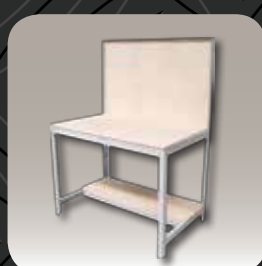
Handy Angle Work Bench