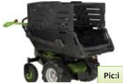
With opt: Skip risers