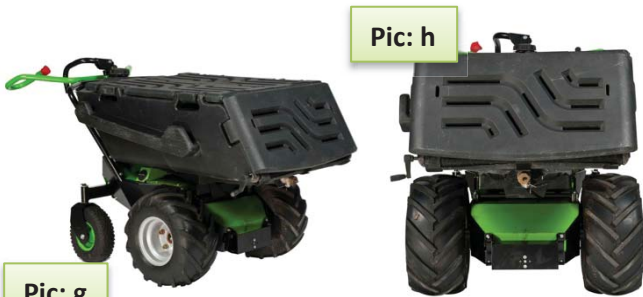
With opt: Skip risers and front