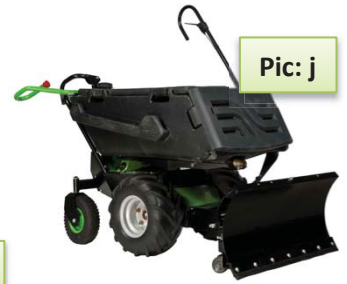
With opt: Snow/Argricultural Blade