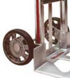
# 10815 Rubber Wheels