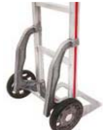
# 86006 Frame Extension Stair Climbers