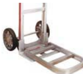
# 301025 Folding Nose F2