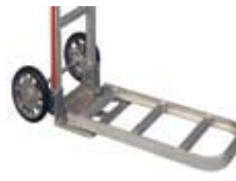
# 301026 Folding Nose F3