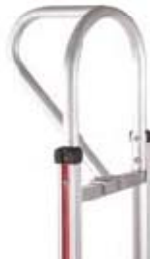
# 300981 Single