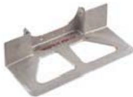
# 300201 U Nose