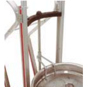
# 301121 Keg Hook