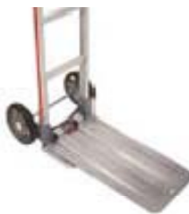
# 301019 Folding Nose F1