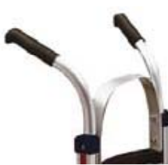
# 86031 Double Grip Handle