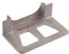
# 300200 A Nose