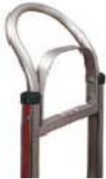
# 30100 Pram Handle