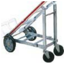
# 301050 4th Wheel Kit