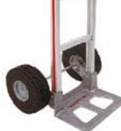
# 121060 Pneumatic Wheels