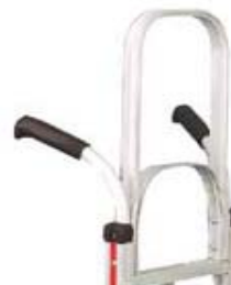
# 40008 Grip Handle