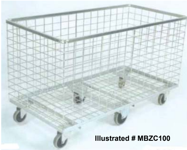
Illustrated # MBZC100