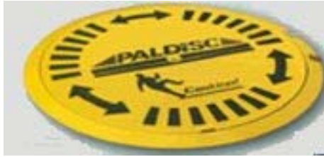
Illustrated # PF0009-with ramp edge