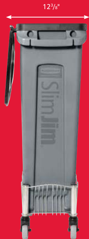
Slim Jim® with Hinge Lid and Stainless Steel Dolly

Molded-in handles, form-fitting stainless steel dolly, and sleek lid options improve Slim Jim's® functionality while maintaining its slim profile.