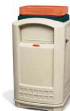
3963 Trays not included