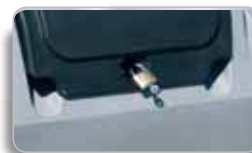
LOCKABLE PUMP COVER PADLOCK NOT INCLUDED

THESE UNITS FITTED WITH FLUID QUALITY ITALIAN PUMP WITH 2 YEAR WARRANTY