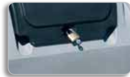
LOCKABLE PUMP COVER PADLOCK NOT INCLUDED