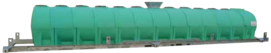
PTM26000FG 26000 Litre Modular Tank with optional forkable steel frame

EXCLUSIVE USE OF POLYETHYLENE ELIMINATES RUST PROBLEMS AND SIGNIFICANTLY REDUCES WEIGHT RESULTING IN INCREASED PAYLOAD AND DURABILITY.