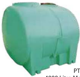
PTM04000FG 4000 Litre Modular Tank