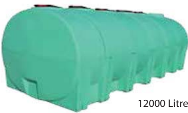
PTM12000FG 12000 Litre Modular Tank

EXCLUSIVE USE OF POLYETHYLENE ELIMINATES RUST PROBLEMS AND SIGNIFICANTLY REDUCES WEIGHT RESULTING IN INCREASED PAYLOAD AND DURABILITY.