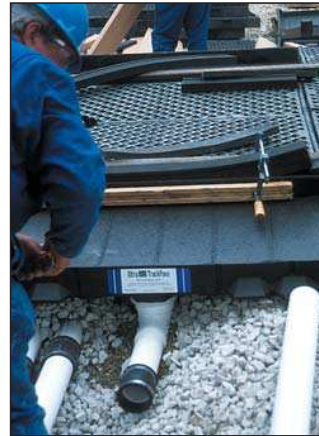
All Center and Side TrackPans are molded with pipe fitting locators at their lowest point. Below-grade piping can be installed to channel large spills to oil/water separators, holding ponds, etc.