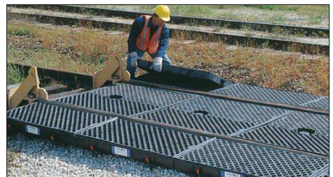
TrackPans with Grates, No Covers