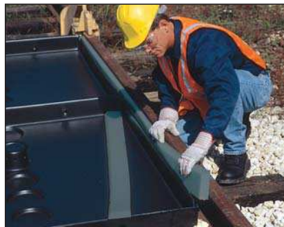
Closed-cell, polyethylene gaskets are then installed to provide a seal between the Pans and rails. (Black gaskets are provided.)