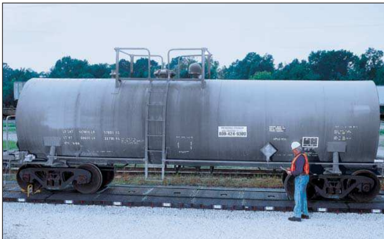
Modular TrackPans can be assembled in any desired length — additional Pans can be added as your containment needs grow.