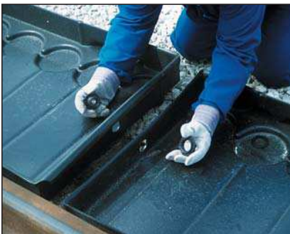
Flow-through channels — All Pans are connected “end-to-end” with bulkhead fittings, and a 76 mm diameter flow-through channel.