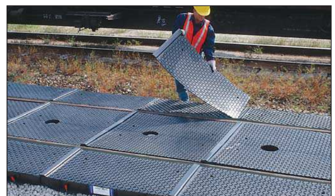
TrackPans with Grates and Covers