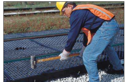
Side Pans are secured in place with rebar or other fasteners. (609 mm long rebar fasteners with protective caps are available as options.)