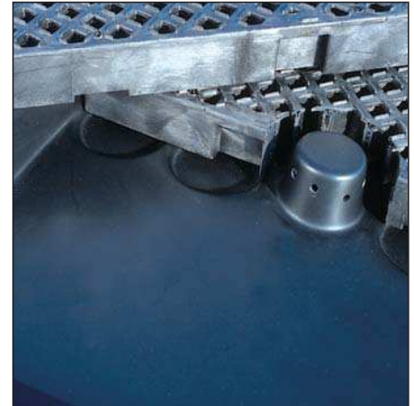
Center TrackPan Stormwater Feature

Center TrackPan Covers Center Cover Overlap Lip