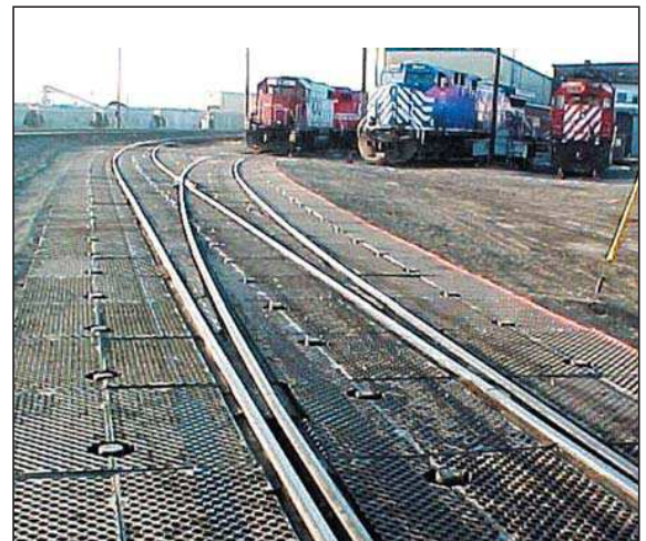
Ultra-TrackPans can be customized to accommodate switches, frogs, adjacent concrete platforms, etc.