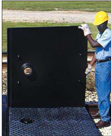
Center Cover Part # 9580

Unique stormwater feature is designed to eliminate "pooling" of rain that falls on top of the Center Pan Covers; rain is channeled onto the ballast between the tracks, stays out of the Pans.