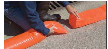
Optional Connectors can be used to connect two or more units.