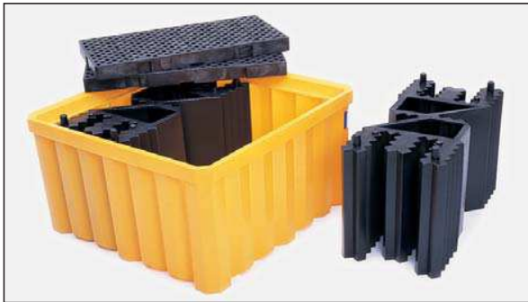
Inner polyethylene supports feature a dense pattern of vertical ribs which provide superior strength. Rated at 7257 kg UDL capacity, the Ultra-IBC SpillPallet will provide years of service under rigorous conditions.