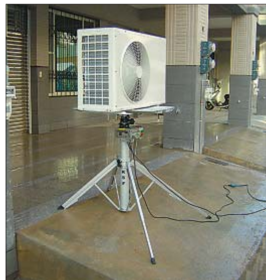
Telescoping Legs Work perfect on a sloping surface or even operates on stairs.