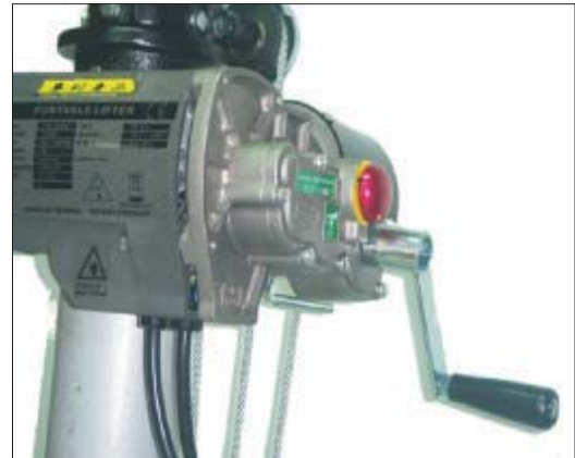
Manually Manual controls available in case of a power failure.