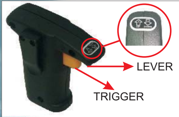
Electric remote control With Variable Speed control.