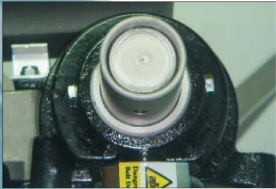
Level Equipped to ensure the proper set up.