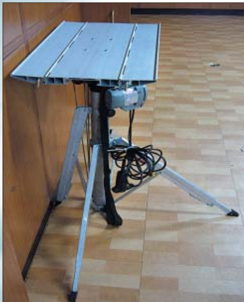
New Retractable leg Allows positioning against a wall. *OPTIONAL FUNCTION!