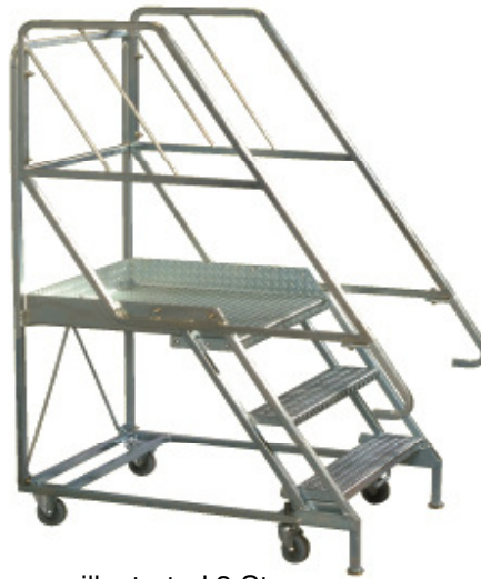
illustrated 3 Step Mobile Platform Assembled

Castors are 100mm Diameter Poly on Nylon. Step Depth:150mm. Vertical Rise between steps: 235mm