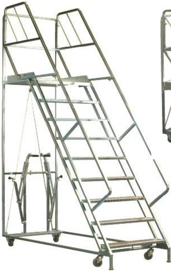
illustrated 9 Step Mobile Platform with fold-up outriggers - Assembled

Castors are 100mm Diameter Poly on Nylon. Step Depth:150mm. Vertical Rise between steps: 235mm