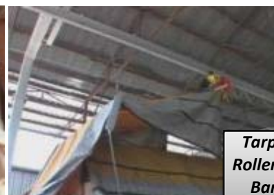
Tarp Roller Bar Rear

All prices/specifications subject to change without notice.