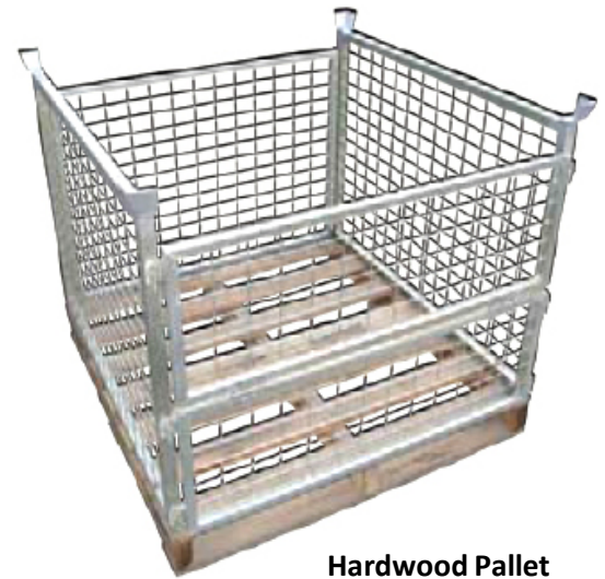
Hardwood Pallet included