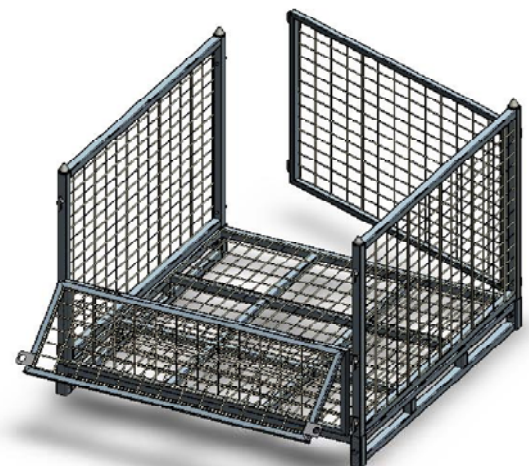
(Front Top Frame & Rear Frame shown in Open position)

All prices/specifications subject to change without notice.