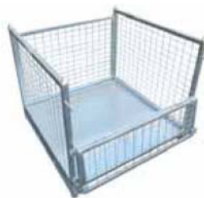
Optional Metal Floor