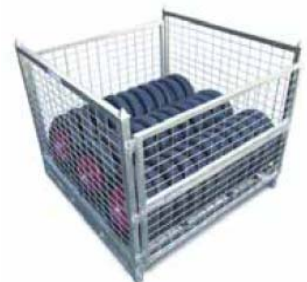
Safe & Secure Storage