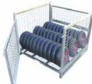
Removable Hinged Gate