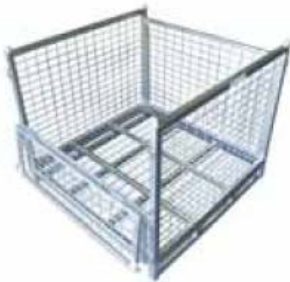
Removable Drop Gate

* Shipping Size SPPCM-01-F/pack 1200x1200x200mm _ Pallet Quantity 16 (1200x1200x2200Hmm)