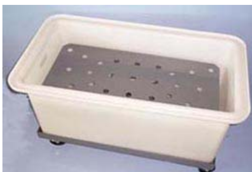
# KH548SBC - with KH548 Moist Linen Trolley