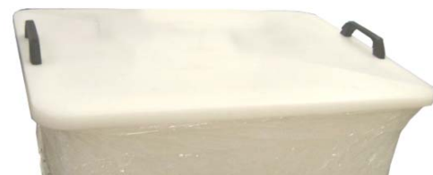
Optional Removable Lid w handles # KH548L & # KH547L