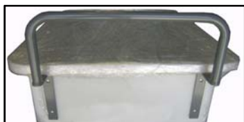
Optional: Push Handle #KH547PH

Castors : Ø125mm H/Duty Nylon - Swivel Finish : Galvanized base for cleaning.