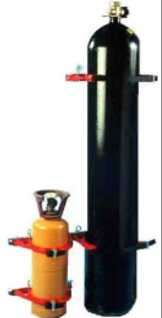
Flexible Multifit Design

BOTTLECHOCKs unique clamp design enables any cylinder within a range of diameters to be held by the same clamp, e.g. the same medium BOTTLECHOCK pictured above fits both cylinders. Save money by using the same BOTTLECHOCK for different sizes and types of cylinders.