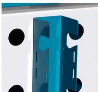
Cable management bracket

Perforated rear ensures airflow when closed or open to avoid over heating.