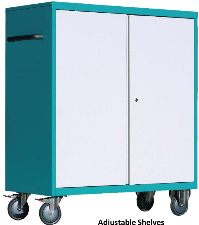
Adjustable Shelves at 30mm increments

Overall Dimension: (nominal) 1020 L x 500 D x 1180 H mm