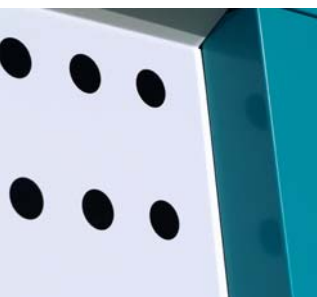
Perforated back panel