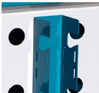
Cable management bracket

Perforated rear ensures airflow when closed or open to avoid over heating.