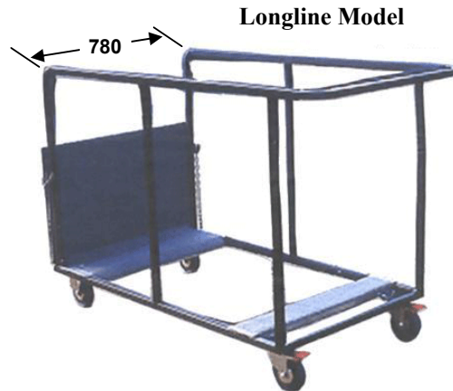
Indicative Picture Only: Trolley for Tables - Rectangular or Round #WHTT95