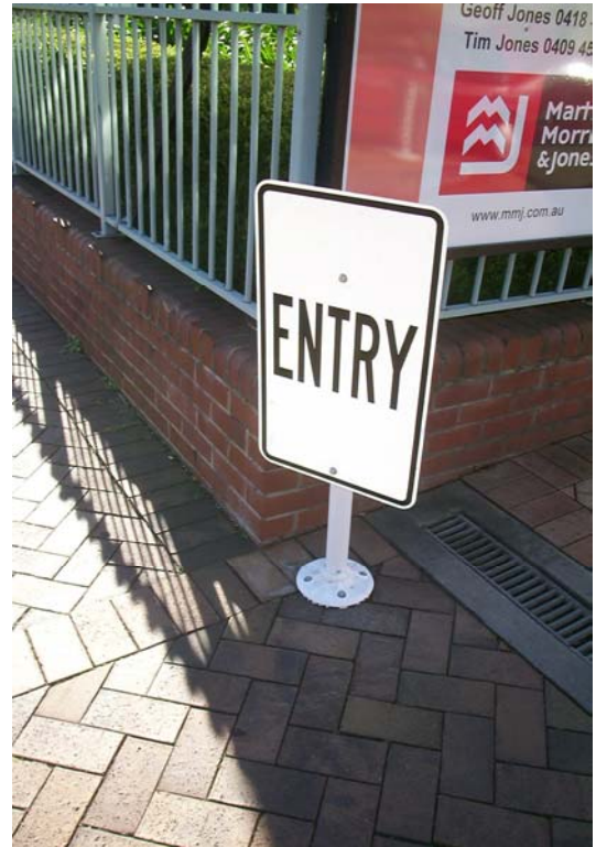
900mm Post with Flex Hit Flat Base & Clamp Single-sided Sign