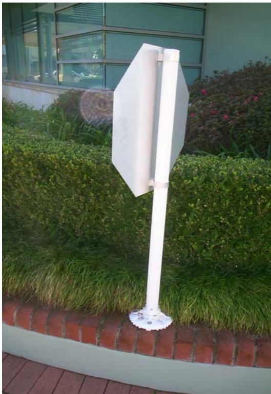
900mm Post with Flex Hit Flat Base & Clamp Single-sided Sign