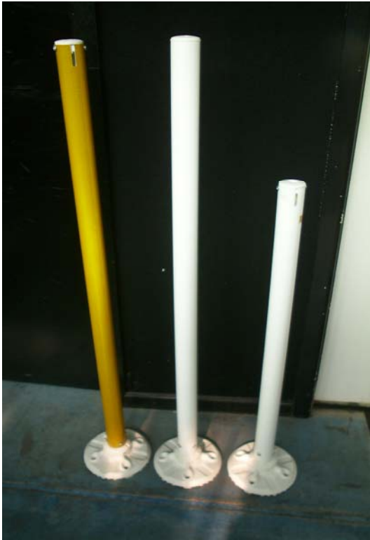
#SPFB120-N-REFL / #SPFB120 / SPFB90-N