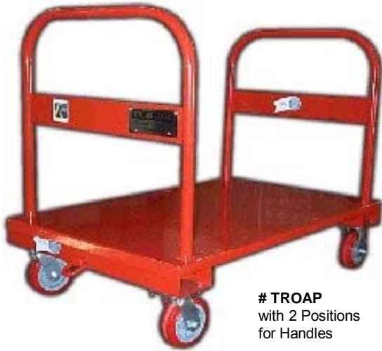
# TROAP with 2 Positions for Handles

Designed to allow easy movement of heavy loads around work site.