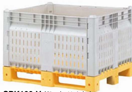
SPK100-V (Single Height)