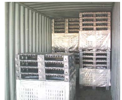
Illustrated - Groups of 5 knocked down bins for transport