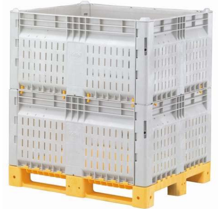
SPK200-V (Extended Height)