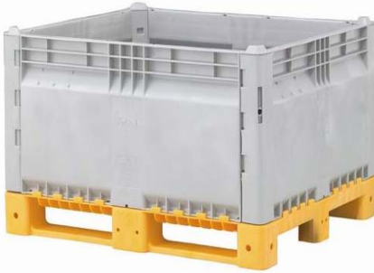
SPK100-S (Single Height)