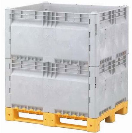
SPK200-S (Extended Height)