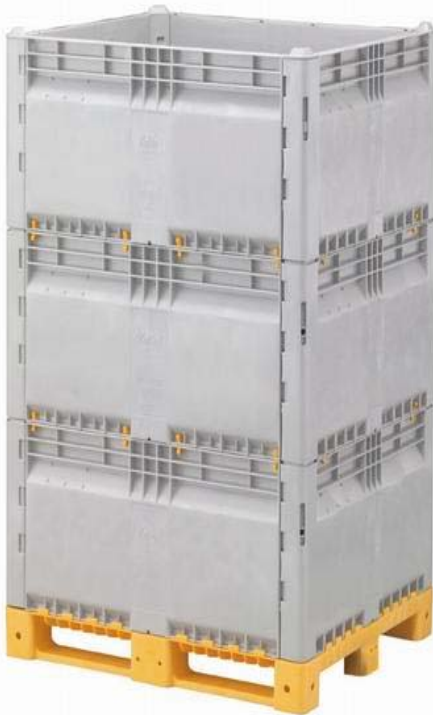
SPK300-S (Extended Height)