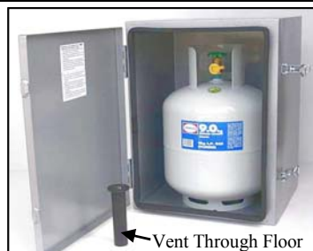
Vent Through Floor