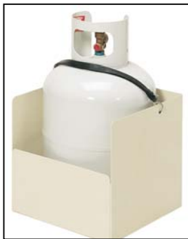
RVLPG RKV LBG Box (Small) RVTS 380MM TARP STRAP