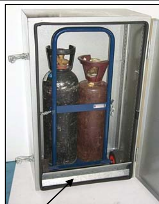
Shown - entry ramp folded up