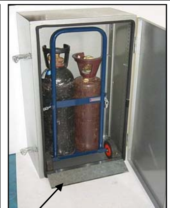
Shown - entry ramp folded down