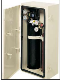
RVGBBL RKV Gas Bottle Box (Large)

For safe carriage of Bottled Gas in enclosed vehicles