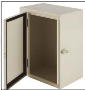
RVGBBS RKV Gas Bottle Box (Small)