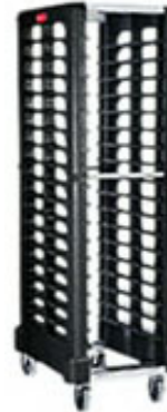
Max Rack System