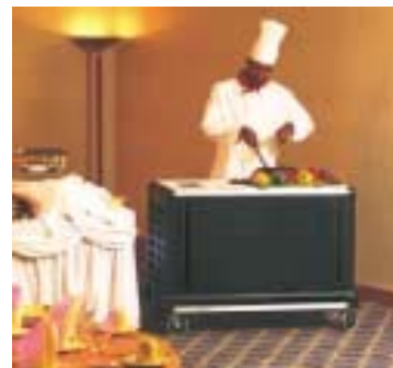
Complements any banquet or front-of-house setting with back panel option.