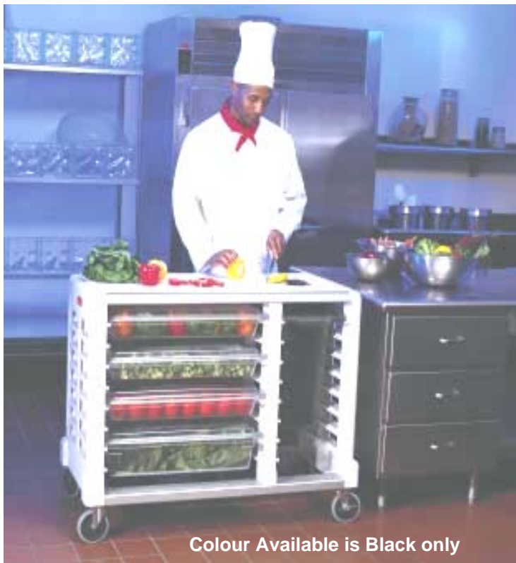
Colour Available is Black only