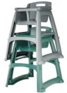
Nest and stack to minimize storage space required