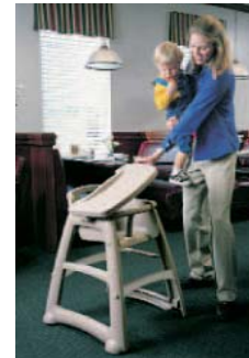
Easy to use "one Hand" tray removal frees other hand to steady or hold child

When installed, wheels are covered to prevent damage and improve aesthetics.