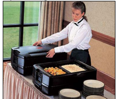
Stylized design reflects a fresh, professional appearance in any catering situation. Highly durable structural-web plastic resists marks, dents and scratches; all-smooth surfaces are easy to clean.