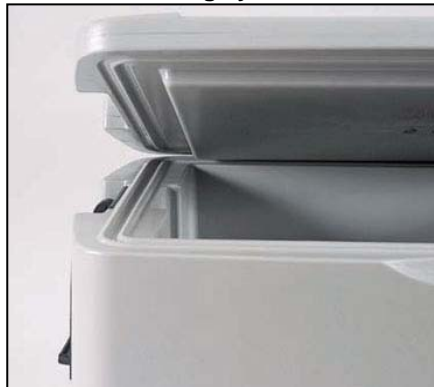
Specially designed serpentine seal helps retain temperature without using unreliable gaskets that can wear out and harbor harmful bacteria.