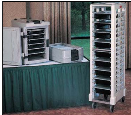
Rubbermaid® CaterMax™ Insulated Carriers work systematically with Rubbermaid® Ma: System™ Racks, Carts and Rubbermaid® X-tra™ Food Pans and Soft Sealing Lids.