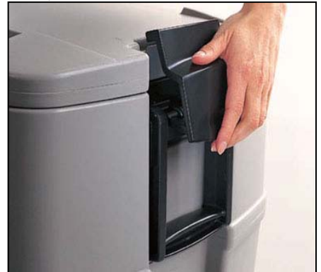
Rubbermaid® CaterMax™ Insulated Carriers feature durable plastic hardware that's easy to latch and carry.