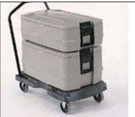
Fits Rubbermaid® Caterer's Triple™ Trolley (#4401-86) for easy transport.