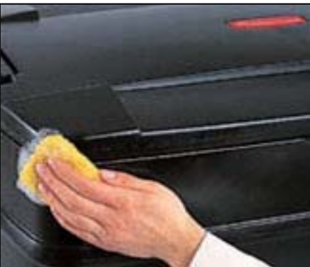
Smooth plastic surfaces clean easily resist dents and scratches.