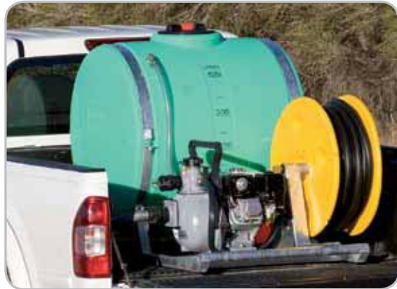
Short unit designed specifically for Dual Cab Utes

400L FIRE FIGHTING UNIT - WITH BAFFLE TANK 1850mm(L) x 1200mm(W) x 650mm(H)