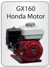
GX160 Honda Motor

2" Aussie Fire Chief fire fighting pump 490 L/m open flow. 5 year warranty.