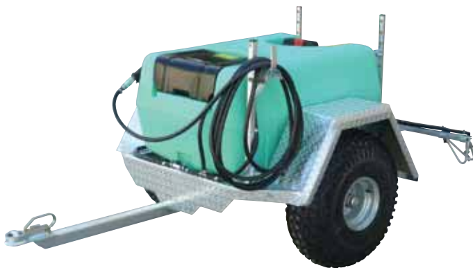
200L ATV TRAILER WITH VERSATILE BOOM

WOULD YOU RATHER TOW YOUR SPRAYER & KEEP YOUR ATV'S RACK CLEAR?