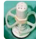
Standard nozzle and valve fitted to rinse bin (Price includes valve and nozzle)