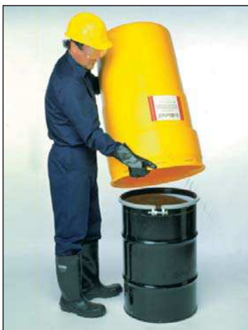
Use the 208 litre Ultra-OverPack to transport damaged 113 litre drums. Also a perfect size for spill kits!

Applications Include: • Overpacking of Damaged or Leaking Packages • Collection and Transport of Soiled Sorbents • Clean-up of Contaminated Sites • Emergency Response • Direct Containment and Transport of Hazardous Solids • Use as Spill Kits