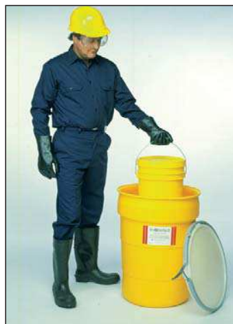
Keep the 113 litre Ultra-OverPack in areas prone to small quantity spills — fill with sorbents to be ready for any emergency.