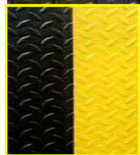
Diamond Pattern surface and Bright yellow border

Please email to spacepac@spacepac.com.au for current pricing