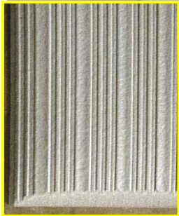
Ribbed surface and bevelled edges