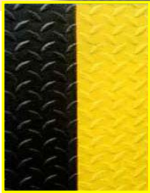
Diamond Pattern surface and bevelled edges