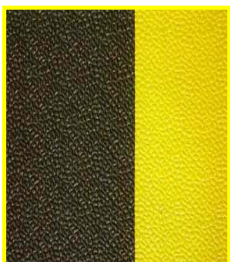
The most Economical Yellow-edge Vinyl foam