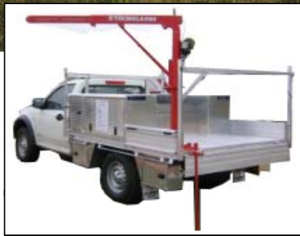
Handwinch Model Illustrated