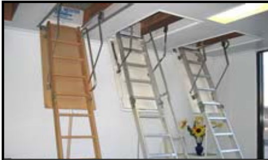
The Access-Boss, with its strength, simple, practical and suited to commercial and domestic applications.

"AM-BOSS" AUSTRALIA'S ONLY LADDER SYSTEM THAT COMPLIES TO THE BUILDING CODE OF AUSTRALIA WE ARE THE SPECIALISTS