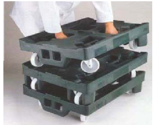
Shown with non-standard nylon wheels.

MATERIAL: Linear Low Density Polyethylene.