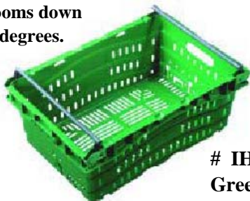
# IH3138 Green Illustrated

Suitable for Coolrooms down to 0 degrees.