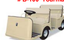
# B-100 Tourmaster