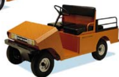
RoadMaster (# R3-80-36-DD) Suitable for Towing