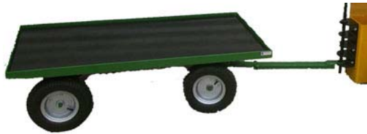
Illustration Shown Attached to Jumbo Tow Motor

Removable Sides are available though not illustrated.