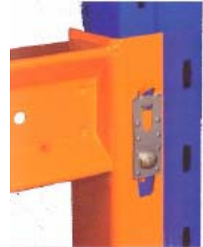
Illustrated: I-Box Beam

All beams are factory welded to beam end connectors. Each beam end connector is fitted with an automatic spring safety lock.