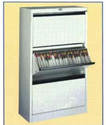
Tilt file cabinets.

All prices / specifications subject to change without notice.