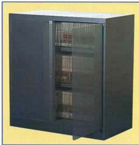
Receding door cabinets