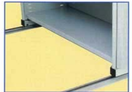
Low profile track