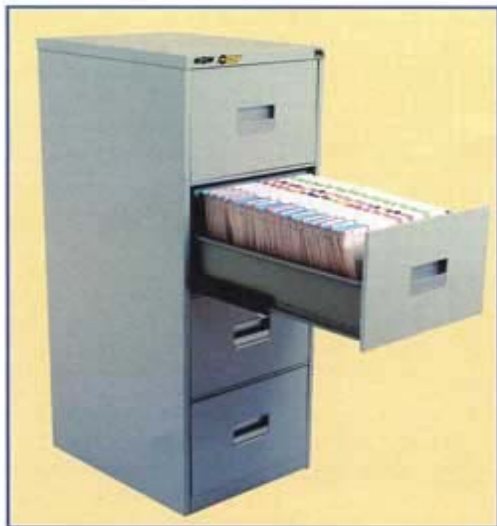
Drawer filing cabinets.