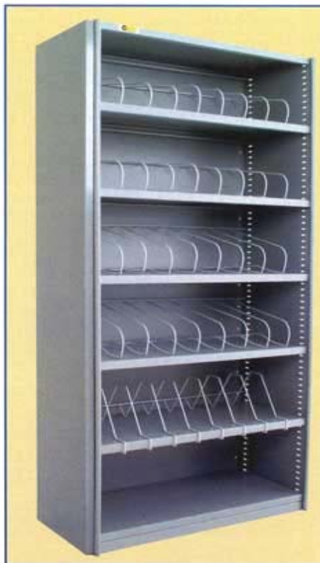
Static open plan shelving.