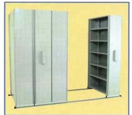
Mobile glide stores