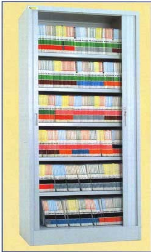
Tambour door cabinets.