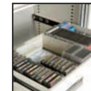
Roll-Out Media Drawer