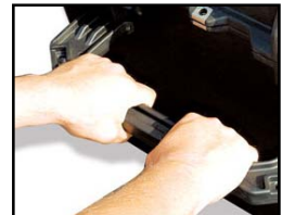
Double Fold Down Handles