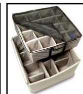
Padded Divider Set Only