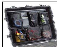
Lid Organizer , made of waterproof Ballistic Nylon. Mesh style pockets with nylon zippers.