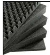
5 pc. replacement Foam Set

Please email to spacepac@spacepac.com.au for current pricing □