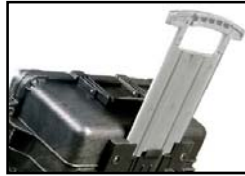
Retractable extension handle