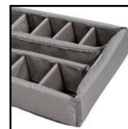
Padded Divider Set Only