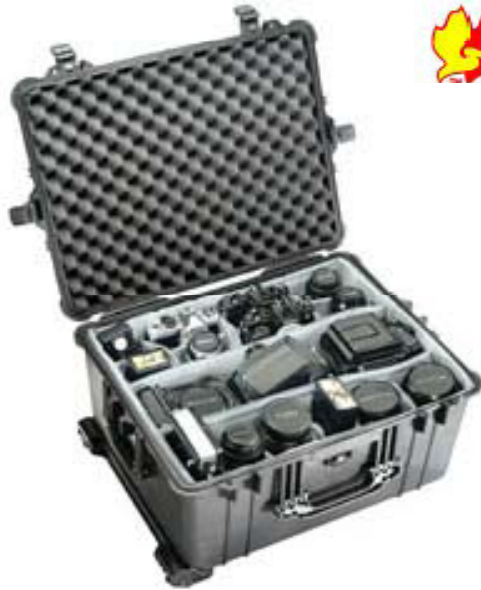
Retractable extension handle