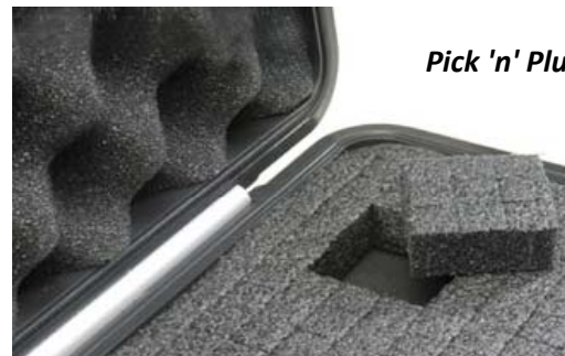
Pick 'n' Pluck Foam