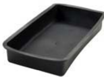
# PE1061 Replacement Case Liner