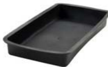
# PE1021 Replacement Case Liner