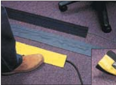
Prevent accidents on carpeting!

Use SAFCORD® in your facility to secure cords and protect against trip hazards. Application is easy - simply press on and lift off. Hook and loop material eliminates messy adhesive residue. Washable and reusable industrial-grade nylon. Choose from Blue, Grey or Yellow. Suitable for carpeted surfaces only.