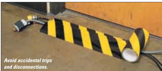
Avoid accidental trips and disconnections.

Tunnel Tape forms a "tunnel" to safely hide wires & cables. Made of durable 0.25mm, laminated polyethylene, Tunnel Tape has a special adhesive backing that adheres to any surface, even carpeting. Tunnel tape can be hand torn, repositioned several times and will not leave a sticky residue when it is removed - adhesive-free 'tunnel' means no glue on cords.