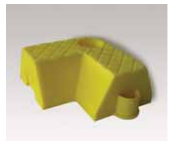
Menni 90 degree corner module.