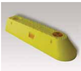
Menni end module.