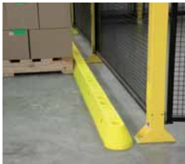
Menni used for asset protection or bunding applications. (See Section 3.4).