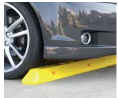
Menni modules used for vehicle wheel stops to comply with AS2890.1:2004. (See Section 5.1.1).