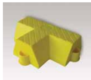
Menni T-intersection module.