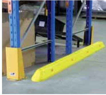
Menni used as a warehouse racking end protector. (See Section 8.1).