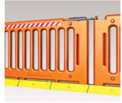
Used with our Q-panel system to create an impact resistant pedestrian fence. (See Section 2.1.1).