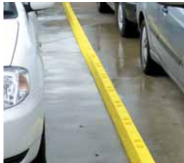
Menni modules connect together to form continuous lengths for traffic delineation.